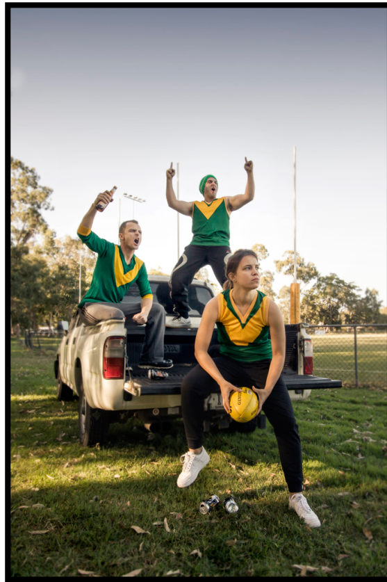
They were pumped.... They were The Forwards!