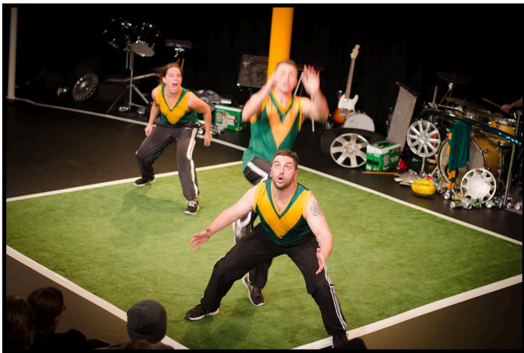
The Grand Final! 3 Actors perform a dynamic, high energy, choreographed 4 quarters of footy!