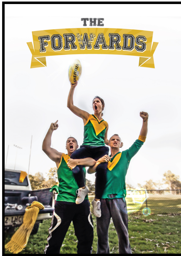
Sample Poster Image and Design by Saffron Jensen